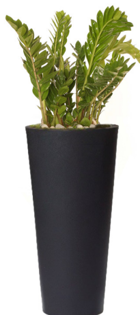
Ref. 113.410 B - Zamioculcas in black Partner pot total ht 1,30 / 1,50 m