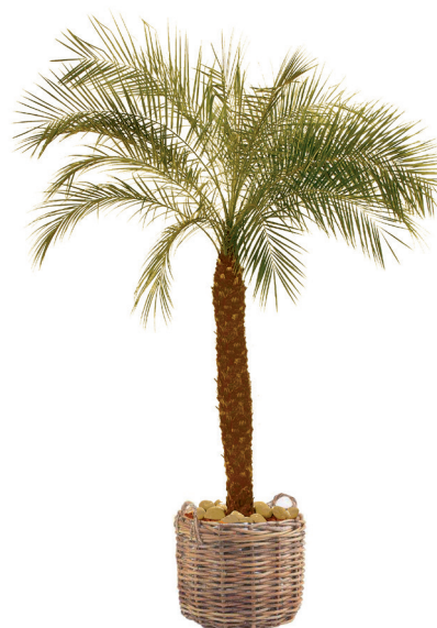
Ref. 113.230 - Phoenix roebelinii ht 1,80 / 2,10 m Ref. 136.300 - Basketwork