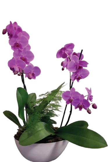
Ref. 182.200 - Bowl of flowers Ø 30 cm