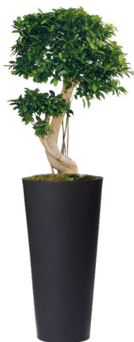
Ref. 113.410 A - Bonsai ficus nitida in black Partner pot total ht 1,20 / 1,50 m

Our floral selection or composition is beyond the capability or creativity of our master gardeners. We guarantee to find the right arrangements for you.