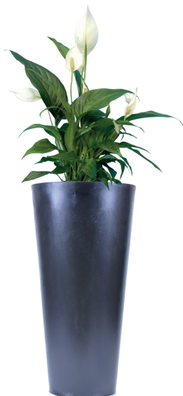
Ref. 113.300A - Spatiphyllum sensation in black Partner pot ht 1,80 / 2 m