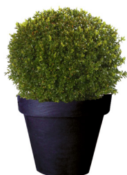
Ref. 111.125 - Box globe Ø35/40 cm ht 0,50m Ref. 134.359 - Vas three black