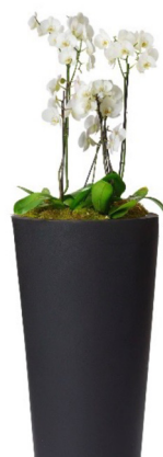
Ref. 113.410 C - Orchids in bac black Partner total ht 1 / 1,10 m