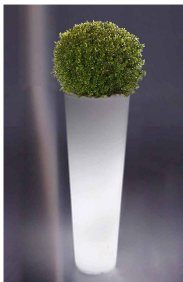
Ref. 134.326 A - PVC New Pot Maxi light Ø 44 cm ht 1,20 m with box globe Ø 45 cm