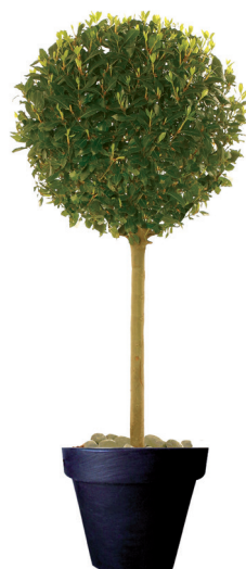
Ref. 112.160 - Bay tree globe ht 1,80m Ø60cm Ref. 134.359 - Vas three black