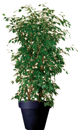
Ref. 113.160 - Ficus ht 1,80/2m Ref. 134.359 - Vas three black