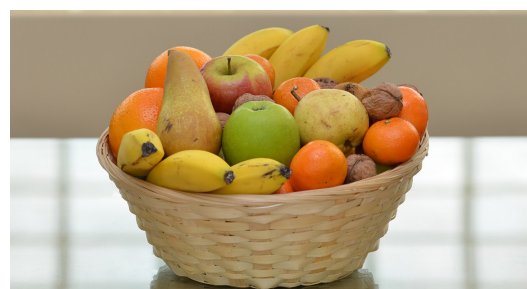
Ref. Pafruit 05K