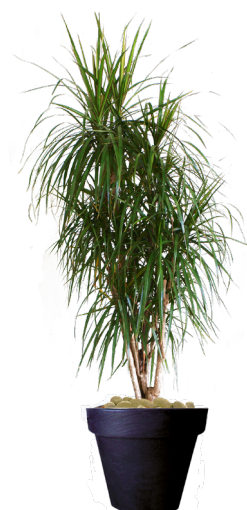
Ref. 113.130 - Dracaena fragrans ht 1,80/2m Ref. 134.359 - Vas three black