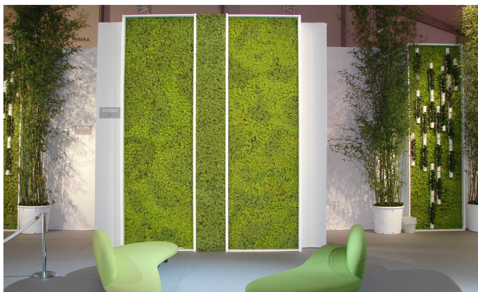
Prices on demand