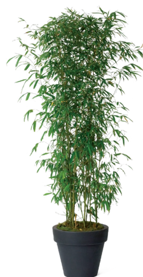
Ref. 111.110 - Bamboo ht 1,50 / 2 m Ref. 134.359 - Black vas three