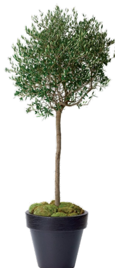
Ref. 112.020 - Olivier Ref. 134.359 - Black vas three