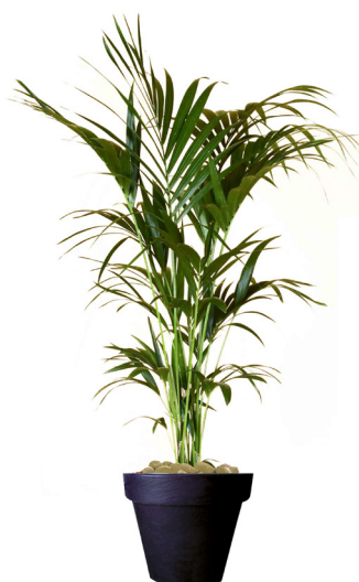
Ref. 113.200 - Kentia ht 1,80/2m Ref. 134.359 - Vas three black