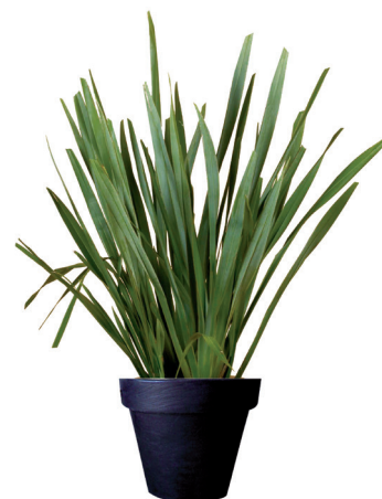
Ref. 112.300 - Phormium ht 1,20/1,50m Ref. 134.359 - Vas three black