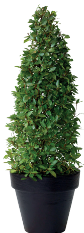
Ref. 112.135 - Bay tree conical ht 1,50m Ø40/50cm Ref. 134.359 - Vas three black

At Gally, we pride ourselves with the reputation of our presentations of both popular and exotic plant selections, presented in standard or tailor-made containers and designed to suit all tastes and decors. The objective is never to clash with or change the existing environment. Our specialists seek to create floral displays that blend with, and enhance, the beauty of the existing colour schemes and atmosphere.