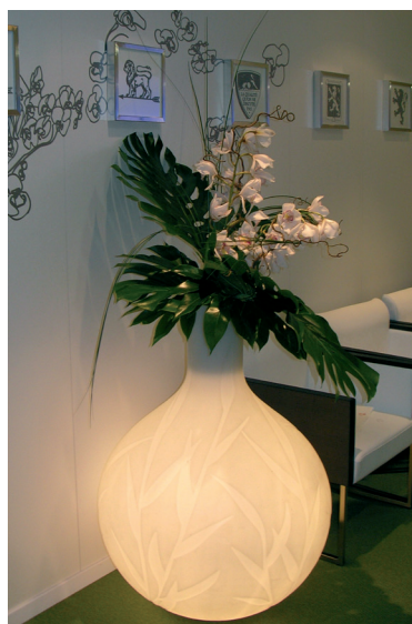
Ref. 134.300B - Princess Light pot Ø 75 cm ht 1 m with Orchids and foliage