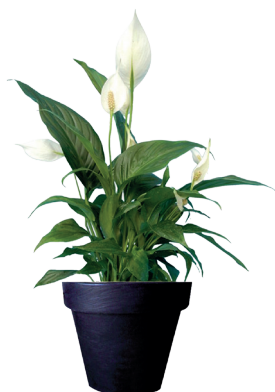
Ref. 113.310 - Spatiphyllum Sensation ht 1,20/1,50m Ref. 134.359 - Vas three black