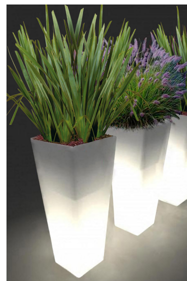
Ref. 134.327 A - PVC Kubis ASQ light 46 x 46 cm ht 1,10 m with Phormiums