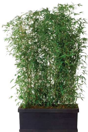
Ref. 142.960 - Black rectangular pot 100 x 32 cm Bamboo hedge ht 2 / 2,50 m