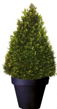
Ref. 111.140 - Box conical Ø50 cm ht 1/1,20m Ref. 134.359 - Vas three black