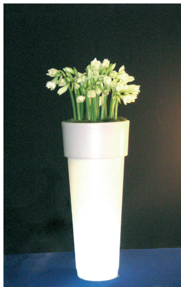
Ref. 134.320 A - Bac Marcantonio light Ø 50 cm ht 1,20 m with white amaryllis

The Gally Design Centre is staffed by knowledgeable and innovative experts who are ready to respond to every customer request. Whether a standard selection or a bespoke solution, our master gardeners guarantee an unsurpassed level of professional advice, project execution and customer satisfaction.