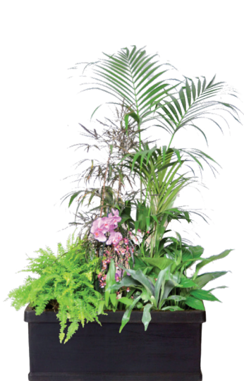
Ref. 143.200 - Black rectangular pot 100 x 32 cm Plants composition