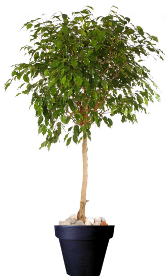
Ref. 123.220 - Ficus globe Ø1,20/1,50m ht 2,50 / 3m Ref. 134.359 - Vas three black