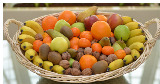
Ref. Pafruit 10K